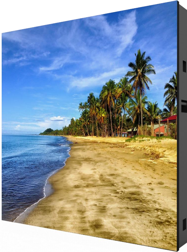
MW77XX-FO-D Outdoor Fixed LED Display Screen